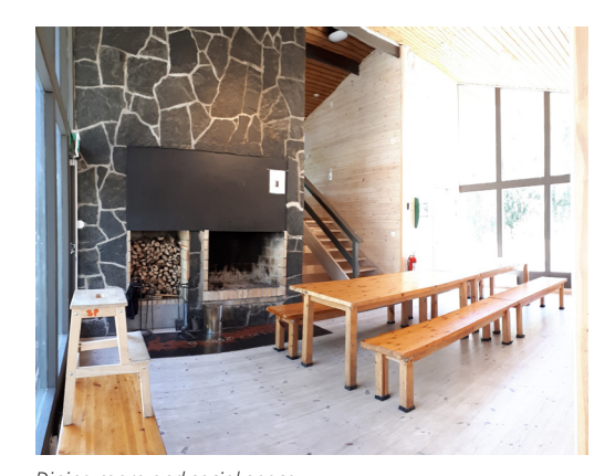
Dining room and social space.