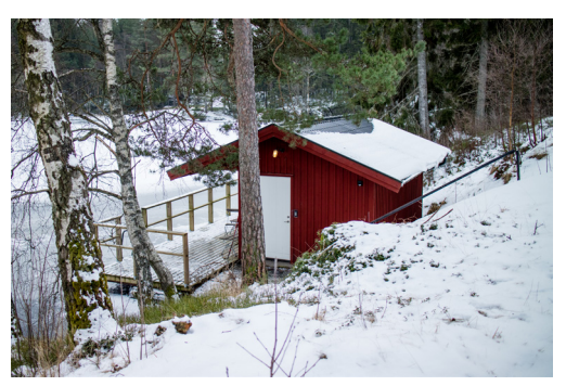
The attached sauna with jetty.