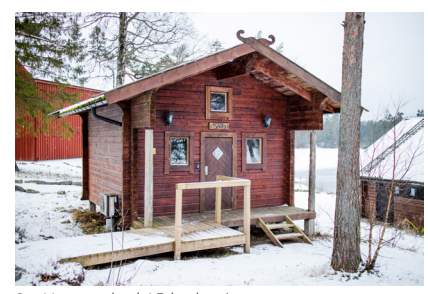
SovU - attached 15 bed unit.

There is a well equipped kitchen with dishwasher and a large dining hall with a fireplace.